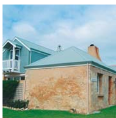
Sympathetic addition to a heritage building

The report on the "Reform of Heritage Related Statutory Provisions" revealed that the existing planning system in SA is underutilised when it comes to the development assessment process relating to State Heritage Places, and substantial legislative change is unwarranted. For example, there is opportunity to create expanded lists of complying development relating to