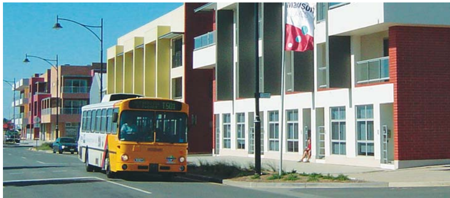
Mawson Lakes – public transport hubs established adjacent to mixed-use, high density developments

The submission prepared for the Eastern Region Alliance congratulated the Government for its renewed emphasis on strategic planning – including the creation of a Regional Plan for Adelaide and the establishment of mixed-use, high density developments around public transport hubs. However, the submission was critical of the Residential Development Code which, if adopted in its current form, would greatly reduce each Council's ability to control some types of undesirable residential development.