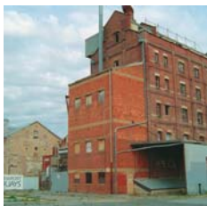
Port Adelaide (the Historic Hart's Mill Complex which will be a focal point for the Newport Quays redevelopment)

Together with a number of high-profile interstate urban designers, URPS was engaged by the City of Port Adelaide Enfield to lead an Urban Design Review Panel (UDRP) for Stage 2B of Newport Quays. Following protracted negotiations with the development consortium, the UDRP and Council found that the proposal was "seriously at variance" with the Development Plan for a number of reasons. It was considered that the proposal had little regard for the existing land form and heritage character of the locality. In addition, the location/ height/ length/style of the proposed buildings created a 'wall of tall buildings' that acted as a barrier to the waterfront, and it would result in a public domain that will be uninviting to visitors and residents. A large number of units also had poor access to both direct and indirect sunlight.