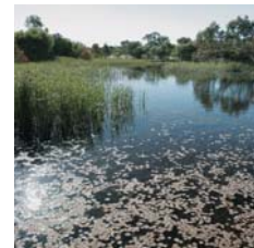
Little Para Outfall Wetland at the end of the Little Para River before discharging into the Barker Inlet

The completion of the PIA award winning NRM Plan by the Adelaide & Mt Lofty Ranges Natural Resources Management Board warrants special mention. Based on the Board's sound background research, as well as extensive community and stakeholder consultation, this is the first NRM Plan adopted in South Australia. URPS was pleased to assist the Board in aspects of the Plan including the review of key State strategies and Development Plans, undertaking social, demographic and economic research, clarifying the relationship between water affecting activities/permits and the development assessment system, and 'on-call' project facilitation.